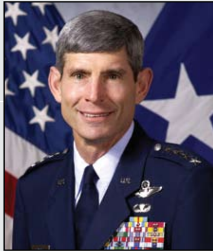
Gen. Norton A. Schwartz Air Force Chief of Staff