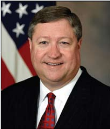
Michael B. Donley Secretary of the Air Force