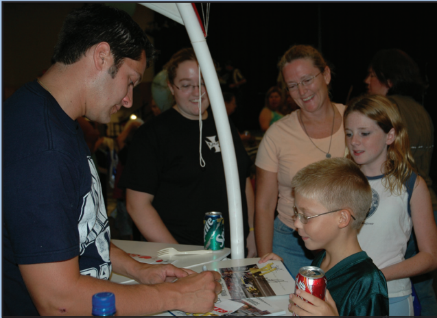
Autograph please